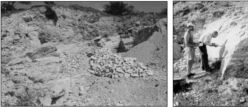
Figure 3, 4. Open limestone quarry from Slava Rusa, when carried out “in situ” tests

By comparing the results obtained for the compression strength with those subsequently determined by direct tests, the validity of the calculus relation was proved, the obtained mechanical resistances registering differences that can be included in the error tolerance limit. The correctness of the values of the longitudinal propagation velocity determined by the surface technique is verified, by comparing these values with the values of the propagation velocity measured with the direct transmission technique, insignificant differences existing between the two values