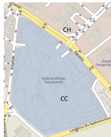
Map of the Congress Centre (CC) and A.U.Th's Ceremonial Hall (CH)